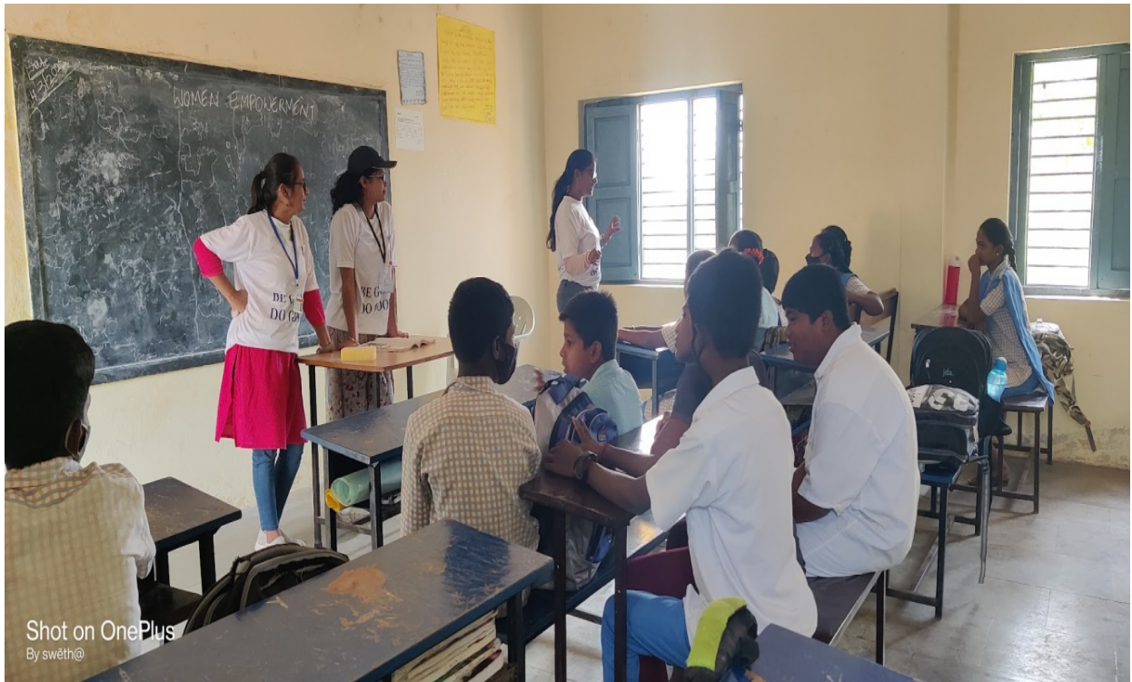
JNTU VOLUNTEERS EXPLAINING WOMEN EMPOWERMENT TO THE ZPHS STUDENTS