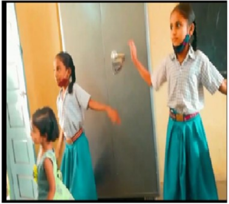
Dance Competition And Quiz