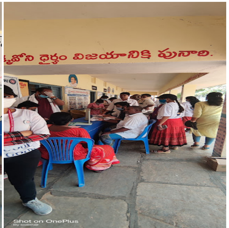
GENERAL CHECKUP FOR ALL AGE GROUPS