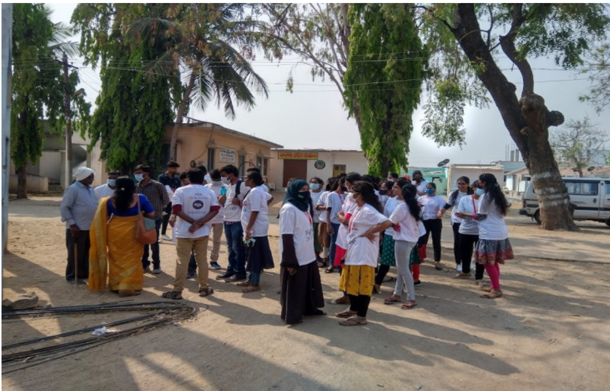
Day 1 Group Discussion About Camp Planning