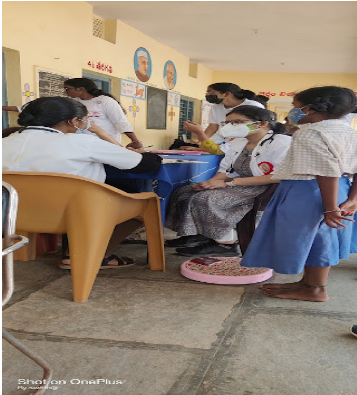
BMS- CHECKUP FOR ALL