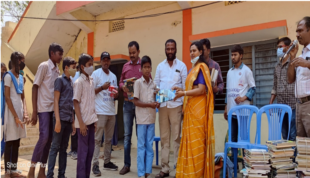
BOOKS AND PENS DISTRIBUTION