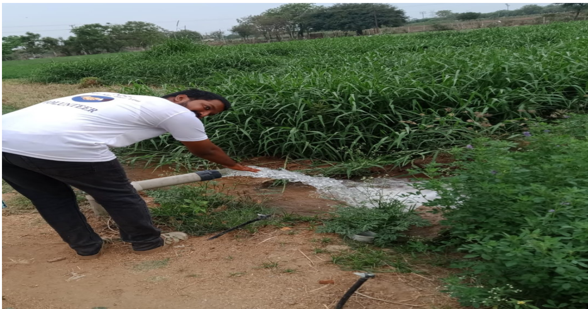
EXPLAINING WATER CONSERVATION TECHNIQUES