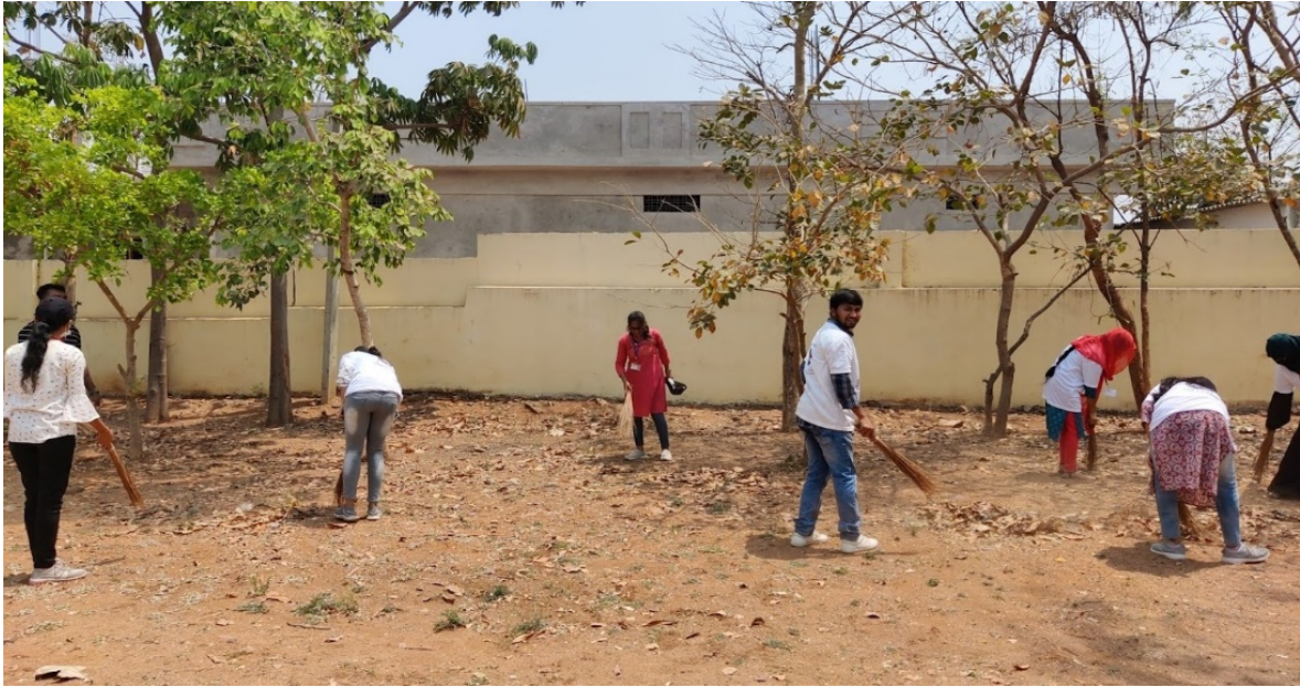
SWACHH BHARATH IN ZPHS SCHOOL AZIZ NAGAR