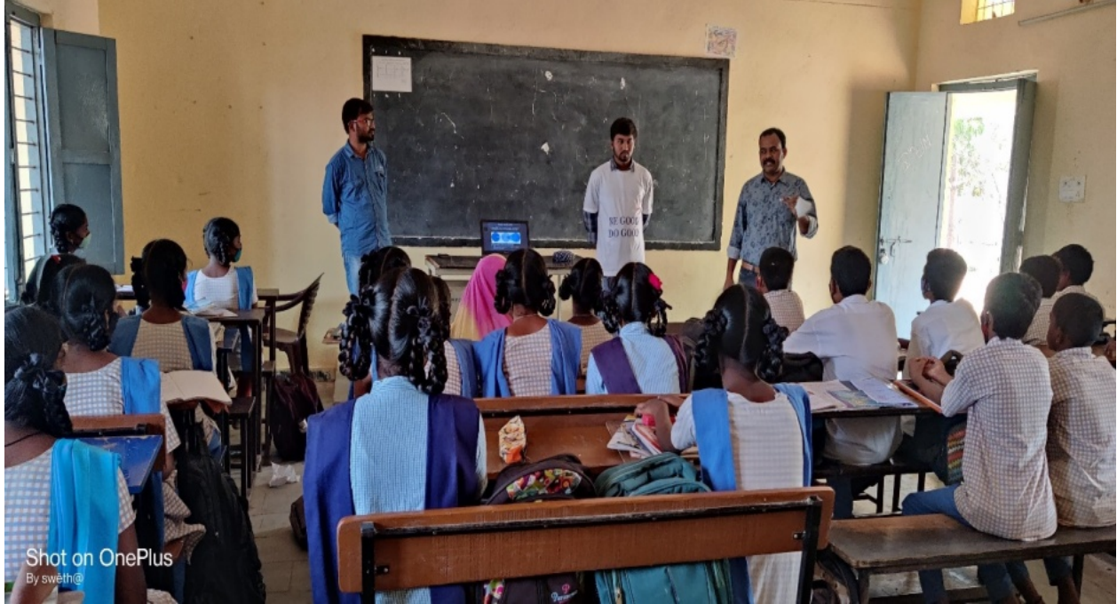
LECTURE ON WATER CONSERVATION TECHNIQUES EXPLAINING TO STUDENTS USING VIDEO PRESENTATION