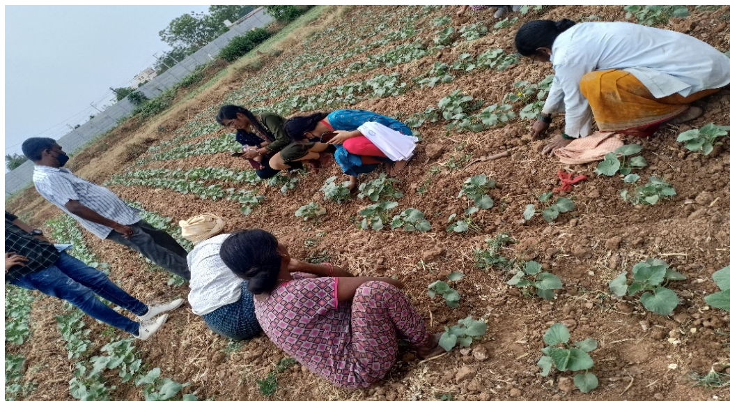
INTERACTING WITH WOMEN FARMERS

one stop Centre scheme, Women helpline Scheme, A comprehensive Scheme for prevention of trafficking and rescue, Rehabilitation and Re-integration of Victims of Trafficking and Commercial Sexual Exploitation (UJJAWALA), SWADHAR,NARI SHAKTHI PURUSKAR, Rajya Mahila Samman & Zila Mahila Samman Mahila Shakti Kendras (MSK) and Instructed the students to discuss with their parents and neighbours. They also have demonstrated some skills for employment of women staying at home. They demonstrated preparation of agarbathi from the floral waste which can be done at homes which would provide income, safe for health and eco-friendly.