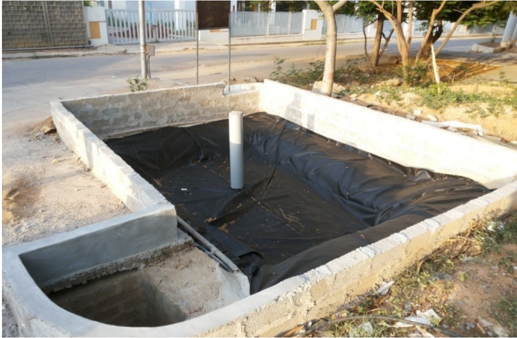
RAIN WATER HARVESTING PITS