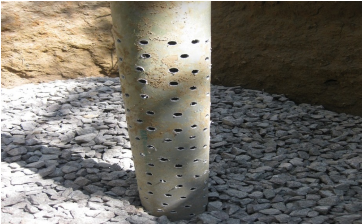
CONSTRUCTION OF RAIN WATER HARVESTING PITS