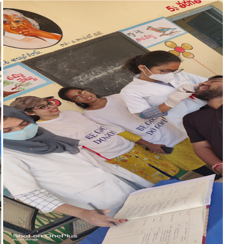
DENTAL CHECKUP FOR ALL