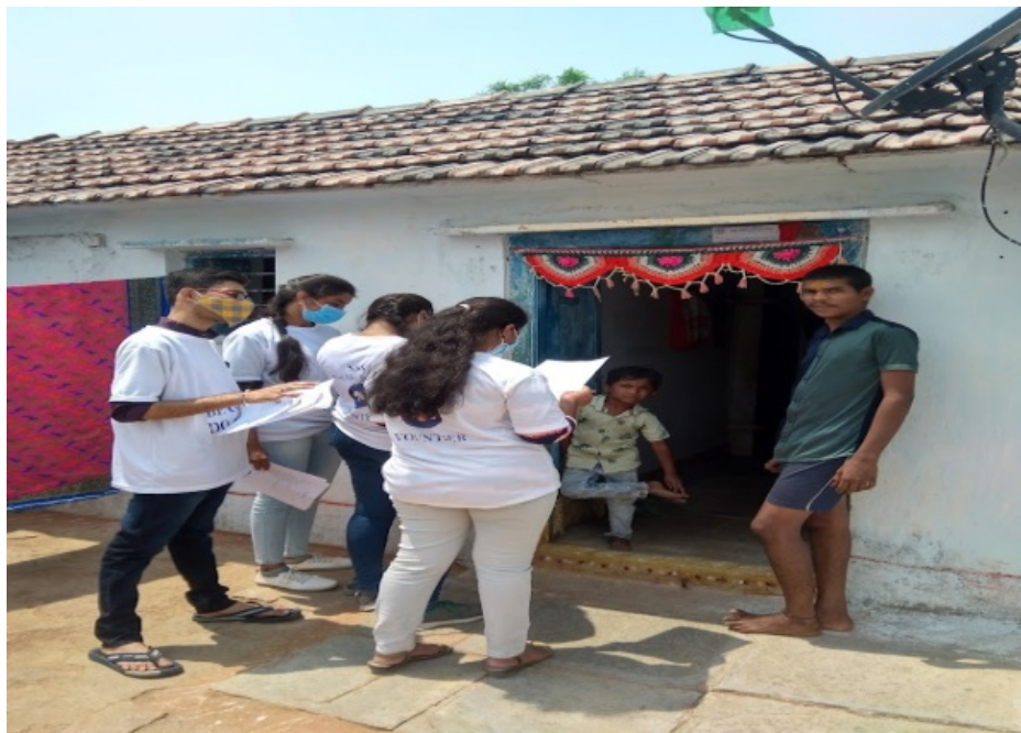
Day 1 Village Survey