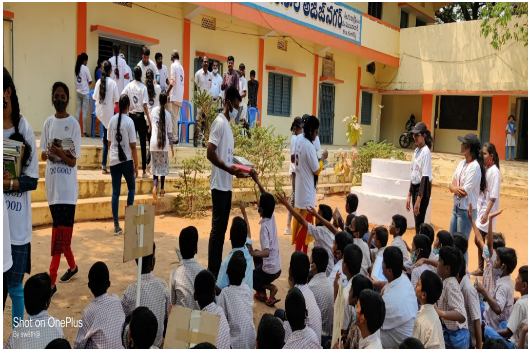
Books Distribution By JNTUH Voluteers